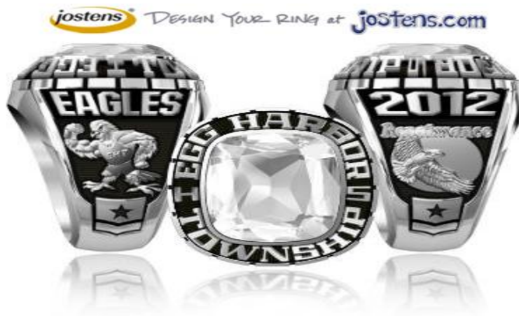
Magnum (A13): Shared ring 6216